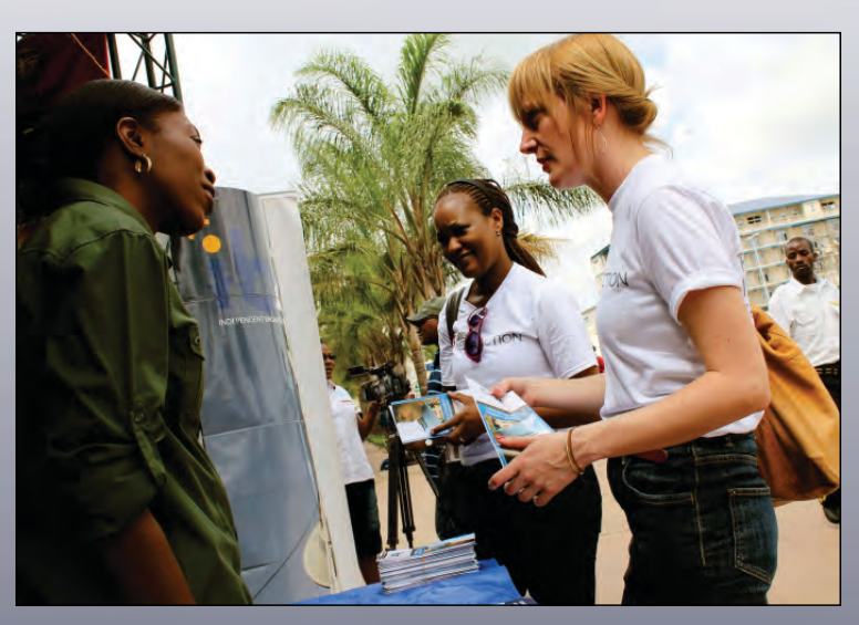
Visitors interacting at the IBA stand during the WRD Commemorations at Arcades Shopping Mall in Lusaka